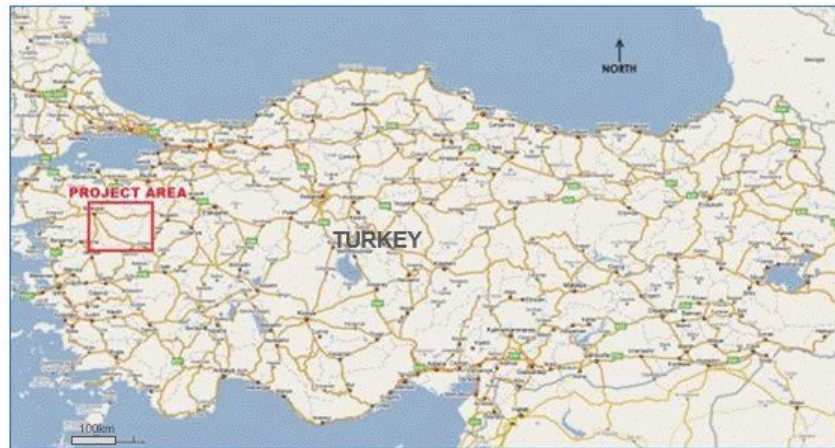
Figure from OreWin, 2019

The Gediktepe Project is located in the Balıkesir province of Western Turkey (Figure 1-1). The UTM Zone 35N, European Datum coordinates of the approximate center of the Project are 636,000E, 4,358,000N.